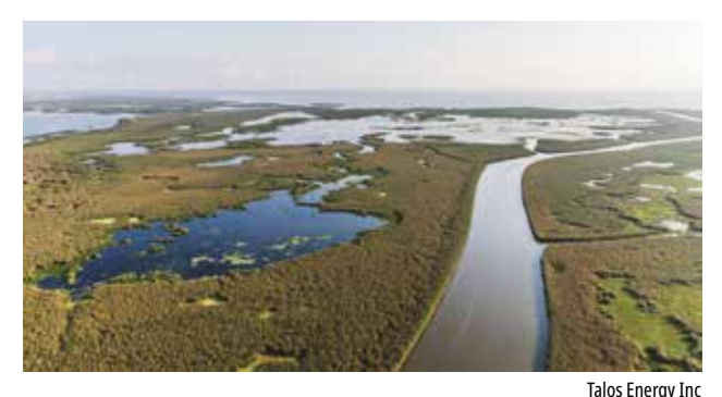
The Bayou Bend CCS project was the first offshore lease in the U.S. dedicated to CO<sub>2</sub> sequestration.

E – PureWest worked closely with Project Canary and TrustWell to certify all of its wells as "Responsibly Sourced" by year-end 2022. A rigorous internal auditing program was established to evaluate leak detection and repair (LDAR) findings and conduct facility evaluations. PureWest voluntarily removed thousands of pneumatic pumps to replace them with solar-powered devices, and removed all of its high-bleed pneumatic devices. The company also deployed stationary methane detection monitors at select sites. Category Score: 90