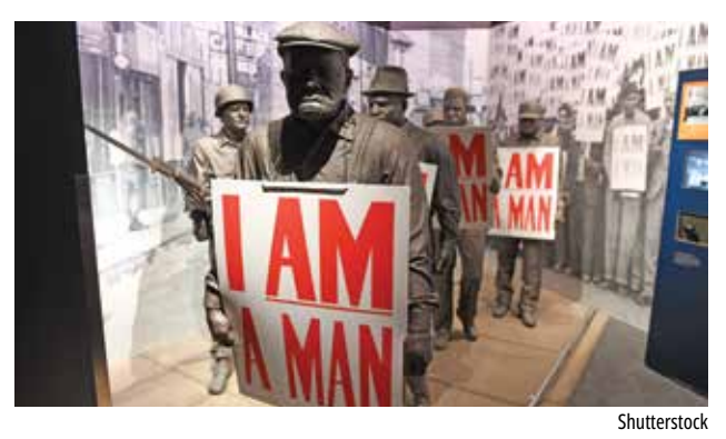
A display in the National Civil Rights Museum in Memphis, Tenn., commemorates the 1968 sanitation workers strike. The term "environmental justice" emerged from the civil rights movement and this strike, in particular.

Persistent gaps among communities with different lived experiences and varying access to meaningful involvement in environmental processes are the focus of recent reem-